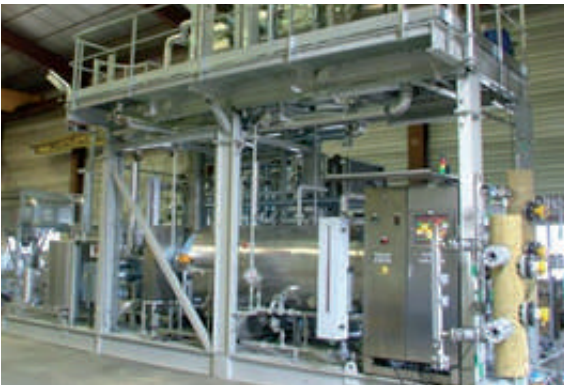
Dimensions: 11m x 2.1m - Weight: 9T