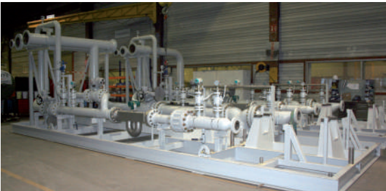
Dimensions: 3m x 10m - Weight: 25 T